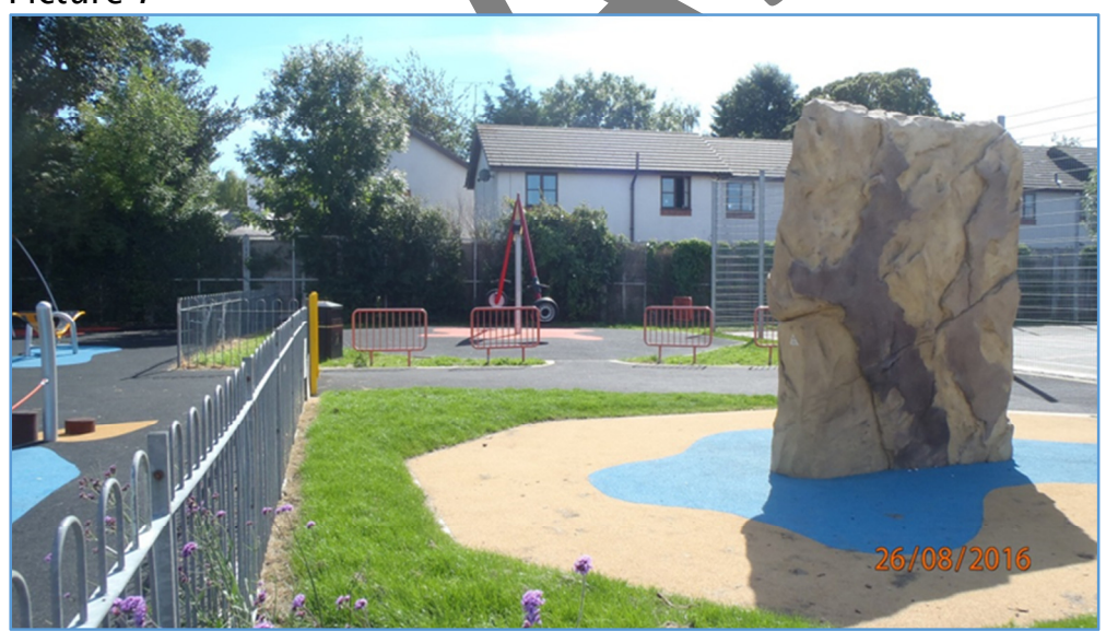
Provision for older children and young people at Ffordd Newydd, St. Asaph

6.594 Where equipment is required, there should be a minimum of five pieces. There should be a range of equipment types for both younger and older children and should be both functional and imaginative. Swinging items designed for older children should be separated from other equipment by fencing or barriers. The play space should